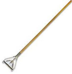
METAL QUICK CHANGE MOP WOOD HANDLE 60"