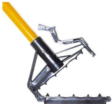
EASY CHANGE MOP FIBERGLASS HANDLE 60"