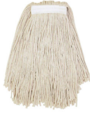
COTTON MOP CUT END