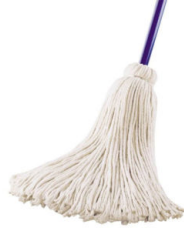
SYNTHETIC DECK MOPS