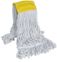
SYNTHETIC MOP CUT END