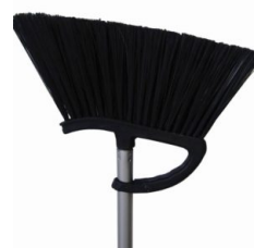
LARGE ANGLE BROOM WITH WISK