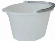
11QT OBLONG HOUSEHOLD BUCKET