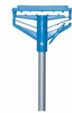
SNAP-TO-GO METAL HANDLE 60"