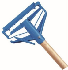
SNAP-TO-GO WOOD HANDLE 60"