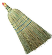
CORN BROOM WAREHOUSE 2 WIRE 2 STRING