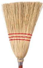
CORN BROOM LOBBY 3 STRING