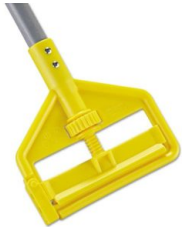
SNAP-TO-GO FIBERGLASS HANDLE 60"