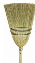
CORN BROOM 6 STRING