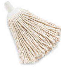
COTTON DECK MOPS