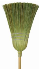
CORN BROOM WAREHOUSE 3 WIRE