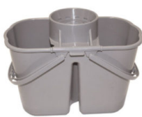
HOME BUCKET WITH WRINGER 15 L