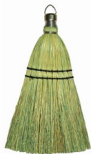
CORN WISK BROOM