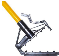
EASY CHANGE MOP FIBERGLASS HANDLE 54"