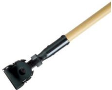
SNAP-ON DUST MOP FIBERGLASS HANDLE 60"