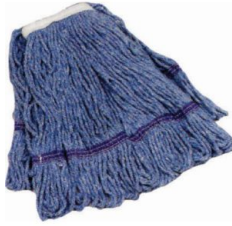
LOOPED BLEND MOP NARROW BAND