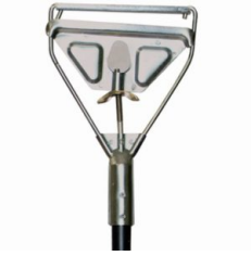
METAL QUICK CHANGE MOP METAL HANDLE 60"