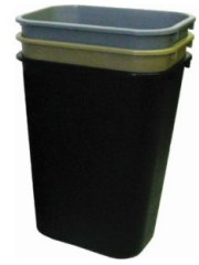
28QT MED SOFT WASTEBASKET