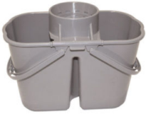
HOME BUCKET WITH WRINGER 15 L