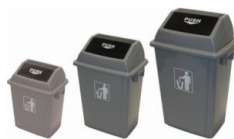
RECTANGULAR WASTECAN AND LID