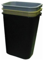
13QT SMALL SOFT WASTEBASKET