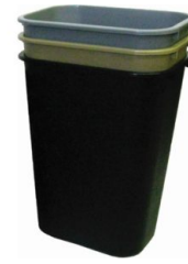
41QT LARGE SOFT WASTEBASKET