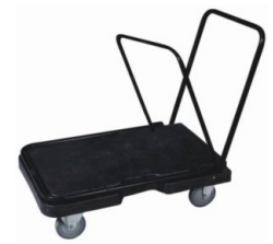
PLASTIC PLATFORM CART (SMALL)