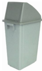
15GAL RECT. CAN WITH PUSH LID