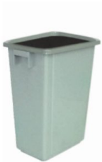
15GAL RECTANGULAR CAN