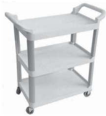
3 SHELF UTILITY CART GREY, BLACK AND BEIGE SMALL