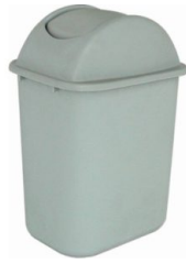
SOFT WASTEBASKET WITH SWING LID