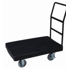
PLASTIC PLATFORM CART (LARGE)