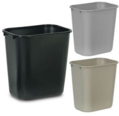
8QT X-SMALL SOFT WASTEBASKET