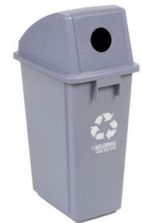
15GAL RECT. CAN WITH CAN SLOT LID