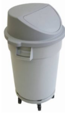
32GAL ROUND CONTAINER WITH DOME LID