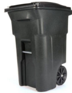
64GAL WHEELED CONTAINER