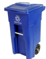
32GAL WHEELED CONTAINER