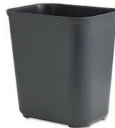
FIRE RESISTANT WASTEBASKET