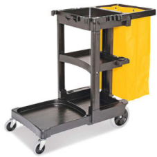
JANITOR CART GREY