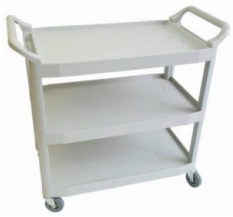
3 SHELF UTILITY CART GREY, BLACK AND BEIGE