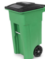
26GAL WHEELED CONTAINER