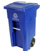
32GAL WHEELED CONTAINER