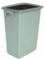
15GAL RECTANGULAR CAN