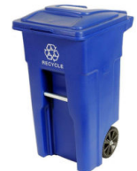
32GAL WHEELED CONTAINER