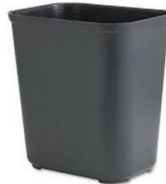
FIRE RESISTANT WASTEBASKET